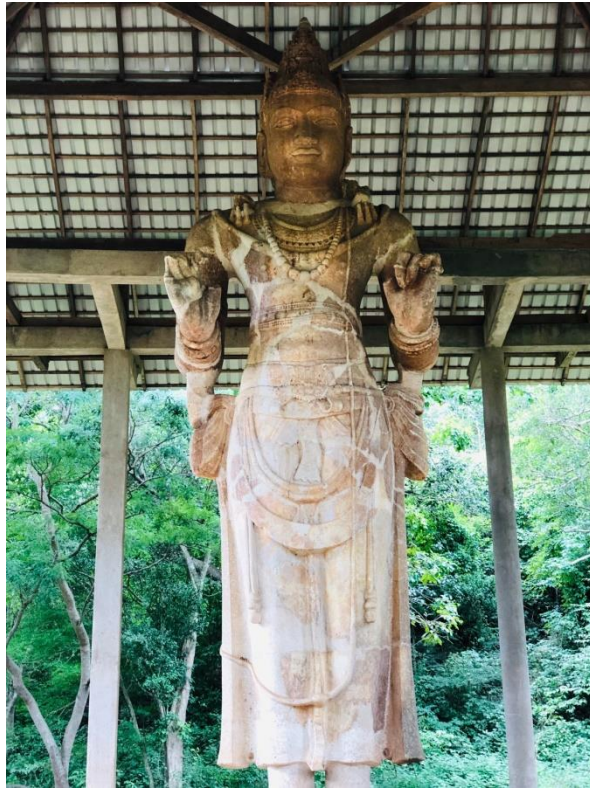
Figure 02:- Maligawila Boddhisattva Statue